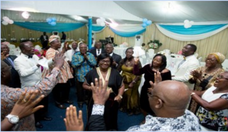
Some of the participants at the Dinner

In the evening of 7 th December 2017, the Association organized an Awards and Dinner Dance at the Fiesta Royale Hotel at North Dzorwulu.