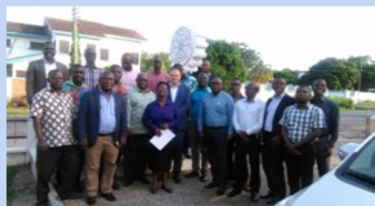
Group Photograph of Participants

The FIDIC Training Courses Modules 3 & 4 were held from 6-9 November 2017 at the Engineers Centre, Roman Ridge, Accra.