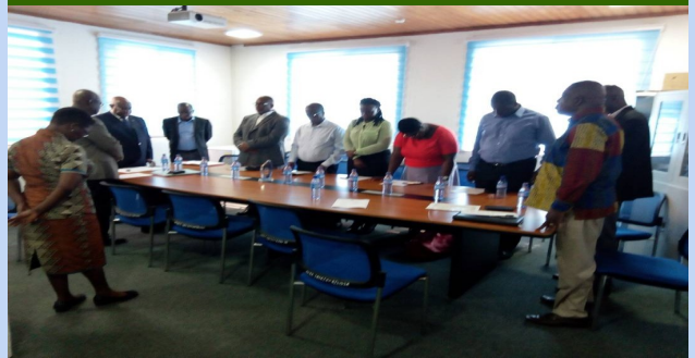
Members of the new council at the Induction Ceremony

Members of the New Council were on January 10, 2018 inducted into office after a short ceremony.