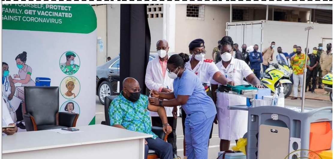
President Akufo-Addo receives his first dose of the COVID-19 Vaccine at the 37 Military Hospital.

GET VACCINATED WHEN YOU CAN AND SAVE LIVES.